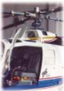
Aerospace & Aviation